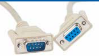
SERIAL PORT CONNECTOR