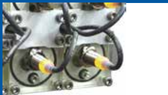
NUMBER OF METERS

Contact us to discuss your monitoring needs.