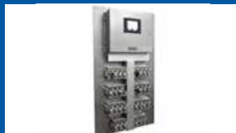
CUSTOM LUBE PANEL