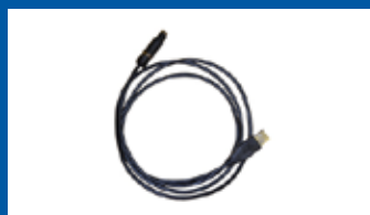
USB - CABLE