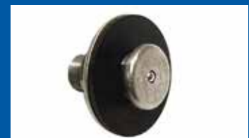
BUTTON HEAD GREASE NIPPLE